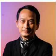
Trần Anh Hùng