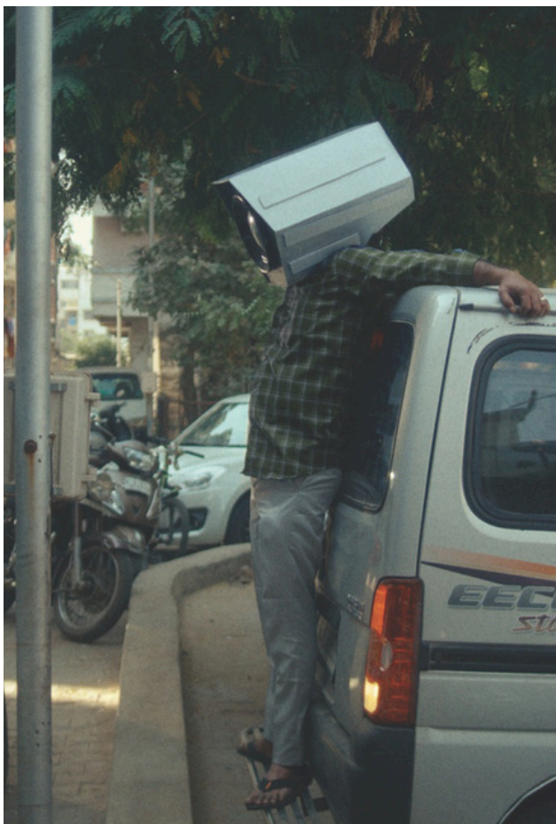
We were here by Bhasin Pranav - India