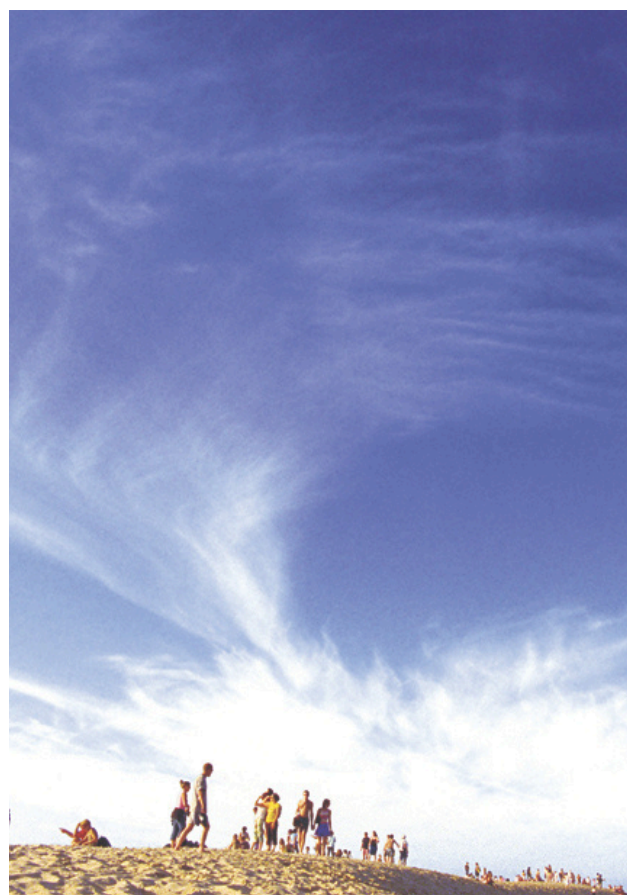
Lila by Broadcast Club